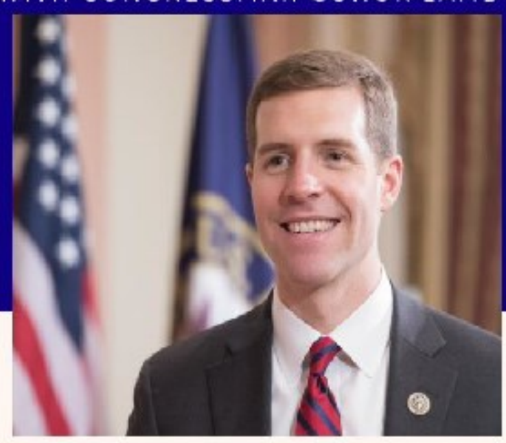
APRIL 8, 2019 8:00 AM

Heritage Valley Health System | Coghlan Education Center 1000 Dutch Ridge Rd.